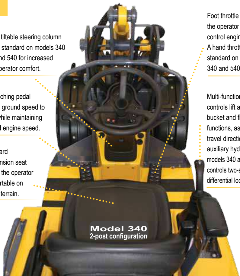
Model 340 2-post configuration

Multi-function joystick controls lift arm, bucket and float functions, as well as travel direction and auxiliary hydraulics. On models 340 and 540, it controls two-speed and differential lock.